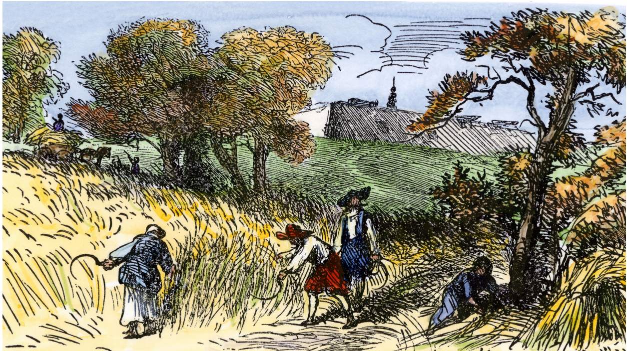
Swedish colonists harvesting crops along the Delaware River.